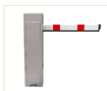
PB Series Automatic Barrier